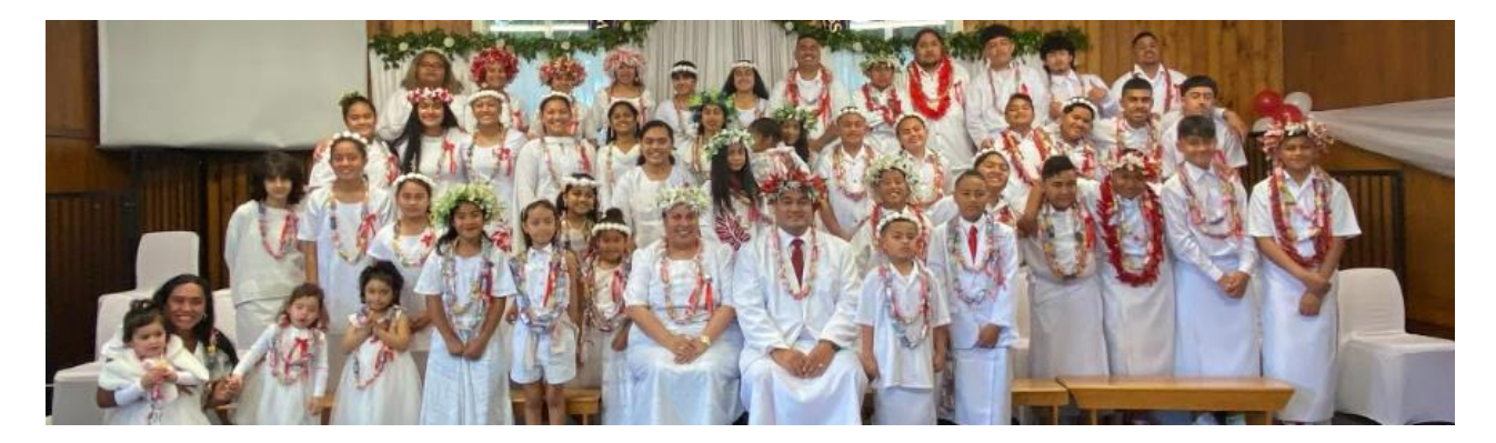
Talofa and Greetings in the precious name of our Lord and Saviour†

2022 has been another year of many changes due to COVID but our Faithbuilders quickly adapted to change when needed. Despite the many changes we continued to thank God for his love and protection over each and every one of us during this time. A BIG thank you to all the parents and Faithbuilders for being faithful and patient as we transitioned through life with COVID the best way we could.