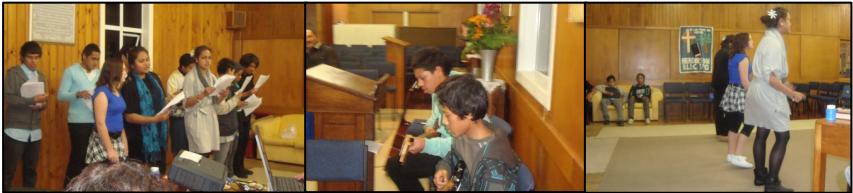
Youth Performing at Youth service 2010. Youth singing, Playing in the band and dancing.

Over the years, St Andrew's Youth Group has organised and participated in numerous events. Through annual youth services, Bright Sundays, fundraising events and participation in Presbyterian sports games and youth nights, the youth here at St Andrew's have dedicated numerous hours to the building of God's work within our Church and wider community.