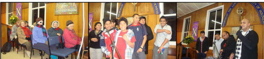
Snow Fundraiser 2010. Members of senior fellowship, youth and also past youth members performing.