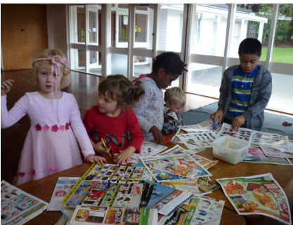
Activity time May 2011

St Andrew's has supported a Sunday School for as long as I can remember. I attended the Sunday School myself, as a child and have been associated with the Sunday School when my own children were part of an active Sunday School.