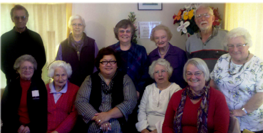
Our group in 2011