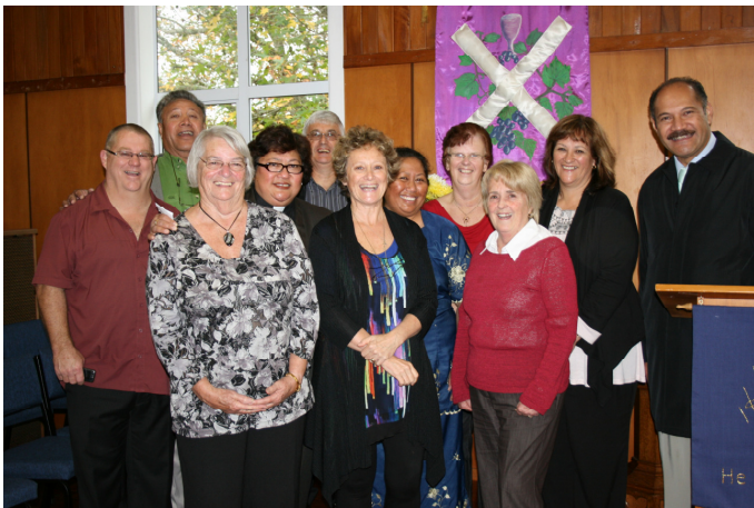
Parish Council May 2011

All in all we had a relaxing time. The highlight for me was sitting outside the Tanu Beach Fales, guitar in hand, singing to our heart's content with the sun setting over the sea. Perhaps we can convince another member of our church to take us to their homeland for a visit soon!