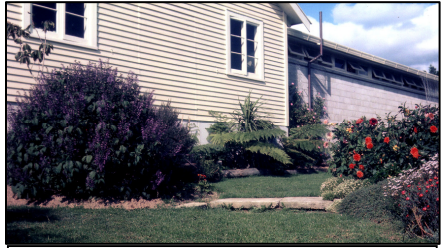
Back of church and hall

Between the church and house was an area over 4 metres wide, bare earth just waiting to become lawn and garden. During the spring we worked hard to set up gardens, plant them, and sow lawn.