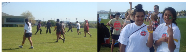
Presbyterian Sports Games 2010

We have also expanded into participating in regional youth services where different Presbyterian Churches take the lead in youth services. This has given us a chance to perform and meet other youth groups around Auckland. In 2010 the youth also participated in the Presbyterian