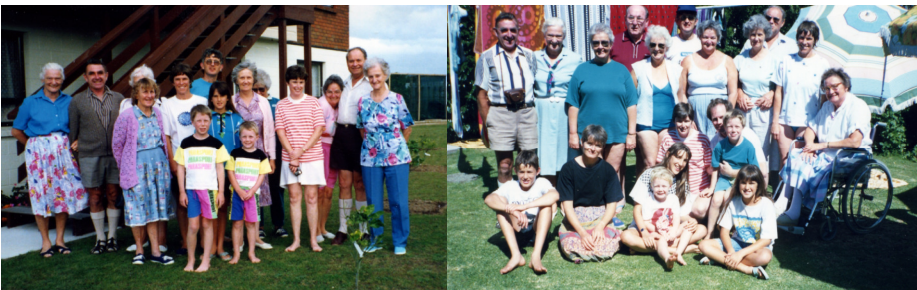
Waihi Beach camps 1991 and 1992