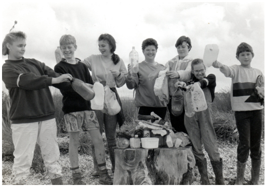
Our Youth helping to clean up Pollen Island

Several times a year our meetings involved dressing up – themes such as Back to Front, Outrageous, Clashing Colours and Bad Taste – with games and supper to match!